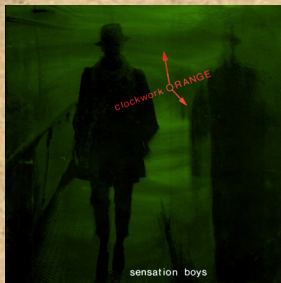
*Tempt 001 (1985) Clockwork Orange. A: Sensation Boys B: Spellbound