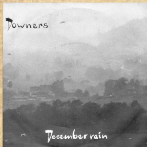
*Tempt 002 (1985) Downers A: December Rain B: 01. Two Bicycles in Summertime 02. Run Away