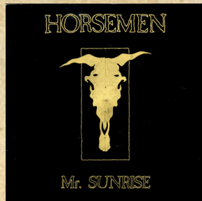
*Tempt 003 (1987) Horsemen A: Mr. Sunrise B: And I Wish